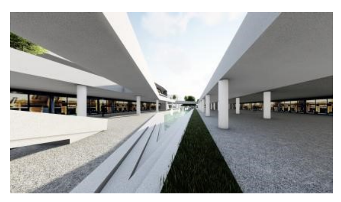
Figure 3.6. Visual Void of Buildings

Visual access is very important for people to feel a sense of freedom uponentering a room. This concept is related to whether people can see the function deeper than just outside the area. Clear visuals seem to be very important in assessing the security of a space.