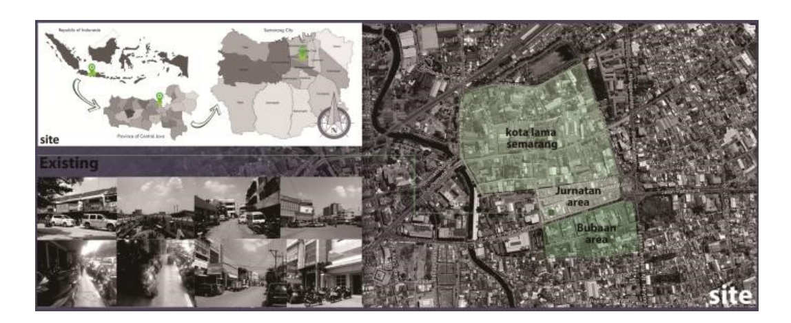
Figure 3.1. Location of the Jurnatan Area (Authors, 2019)