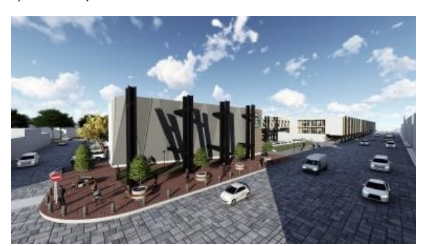
Figure 3.7. Pedestrian Paths Design (Authors, 2019)