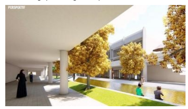
Figure 3.8. Waterfront Schema (Authors, 2019)

Pedestrian ways will be widely used if they meet aspects of comfort, safety, and guaranteed efficiency (Sisiopikua & Akin, 2003). Pedestrians who pass through pedestrian ways have a different character, which is seen from age and gender, carrying goods while walking, and moving in groups, and other special needs (Rastogi, Thaniarasu, & Chandra, 2011). Pedestrian ways in Jurnatan area are designed at a human scale, and to meet the above aspects, with consideration of climatic conditions in Indonesia with a tropical climate (see figure 8).